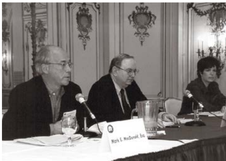
Troubled Company Acquisitions Panel