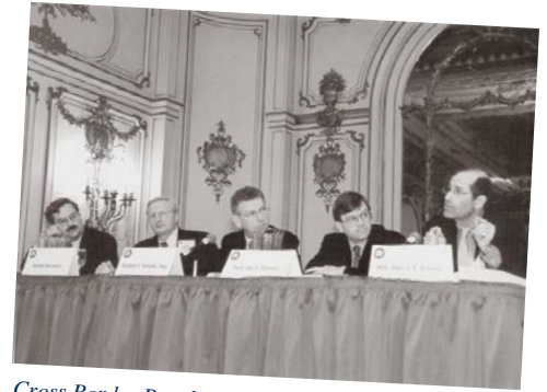
Cross Border Panel