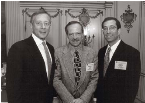
Hot Topics Panel