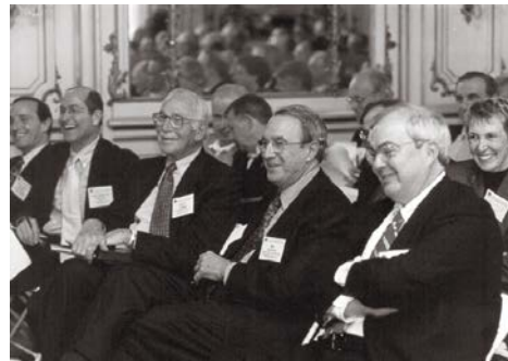
Lighter Moment During Panel Session