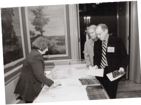
Educational Program Registration