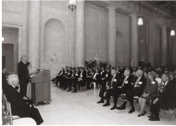
Great Hall of the Supreme Court Class 11 Induction Ceremony