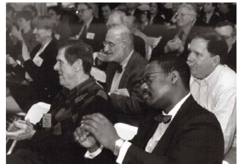
Attentive Fellows in Attendance During Panel Sessions